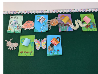
Our Art Work