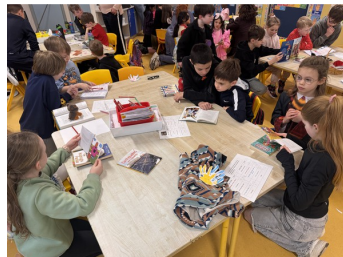
Show and Tell