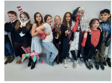
Dress up Day