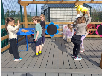
Outdoor Classroom Fun