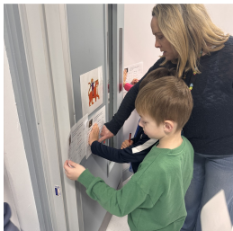
Book Week Hunt

On World Book Day senior infants were so busy reading with their buddy class and doing a book hunt around the school. We took part in lovely story time in class and for Show and Tell brought in our favourite books from home to share with our friends and teacher.