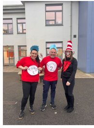
Dr. Seuss Characters