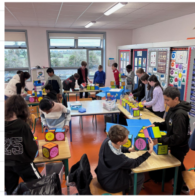
Action Research Play