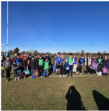
North Kildare Rugby Blitz