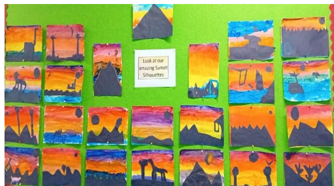
1 st Class (Cherry)